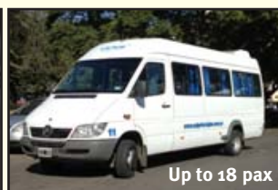
Up to 18 pax