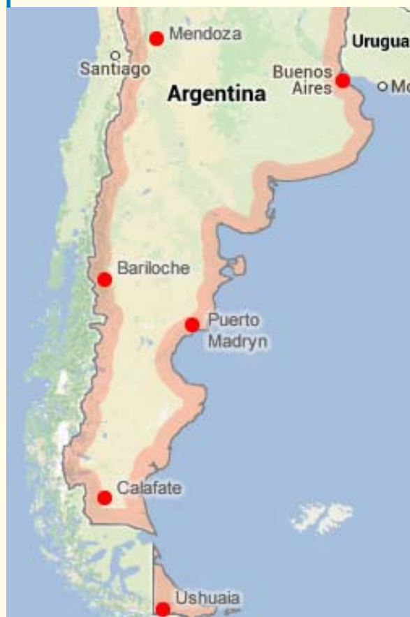
Map of PATAGONIA Argentina