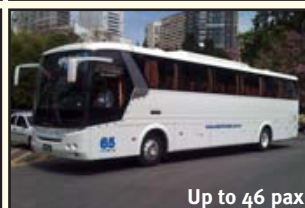
Up to 46 pax