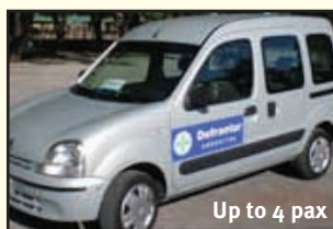
Up to 4 pax