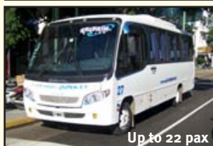
Up to 22 pax